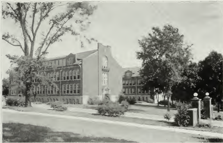
McGUFFEY HALL—NORTH VIEW

McGuffey Hall is the center of activity for the students preparing to teach.